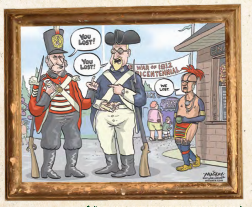
♦ RE-ENACTORS ARGUE OVER THE OUTCOME OF THE WAR OF 1812

Take a look at the cartoons below and analyze them by using the criteria in the chart to the right. You may find this easier to do with a partner.