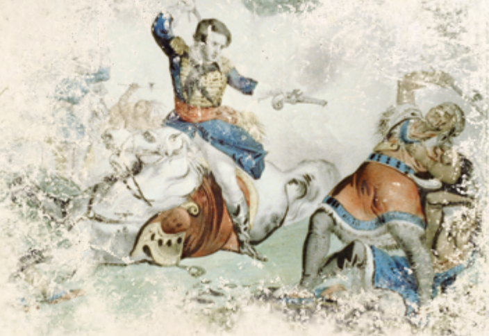
♦ DEATH OF TECUMSEH: BATTLE OF THE THAMES 18 OCTOBER 1813 BY N. CURRIER, 1846.