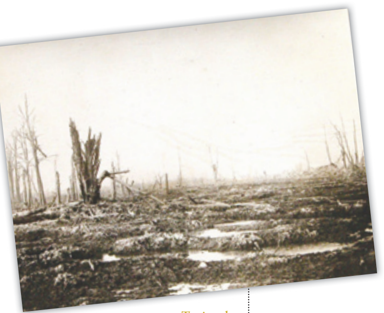
To view the original document, visit www.dominion.ca/passchendaele

"I fell in a trench. There was a fella there. He must have been about our age. He was ripped shoulder to waist with shrapnel. I held his hand for the last 60 seconds of his life. He only said one word: 'Mother.' ... He passed from this life into the next, and it felt as if I was in God's presence. I've never got over it. Never."