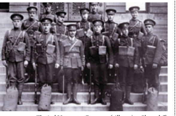
The 3rd University Company (Alberta) at Shorncliff, England, equipped with Canadian Ross rifles and kit

ithout a doubt, Canada made many significant contributions to the outcome of the First World War and in the process came of age and was internationally recognized. When Britain declared war on Germany in August of 1914, Canada, like all the other Dominions within the British Empire, was automatically at war. Canadian contributions and sacrifices were disproportionately high. Canada had a population in 1914 of barely 7 million and yet it suffered 67,000 deaths and 173,000 wounded on the battlefields of Europe. Nevertheless, Canadian troops, fighting for the first time under a Canadian-born commander, gained a reputation as a crack fighting force. Battles such as Vimy Ridge, Ypres, the Somme, and Passchendaele went down in Canada's sterling military history.