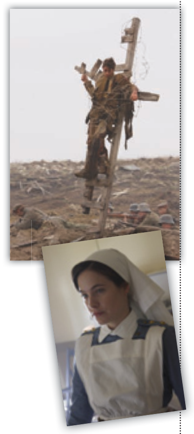
To view more images from the film, visit www.passchendaelethemovie.com