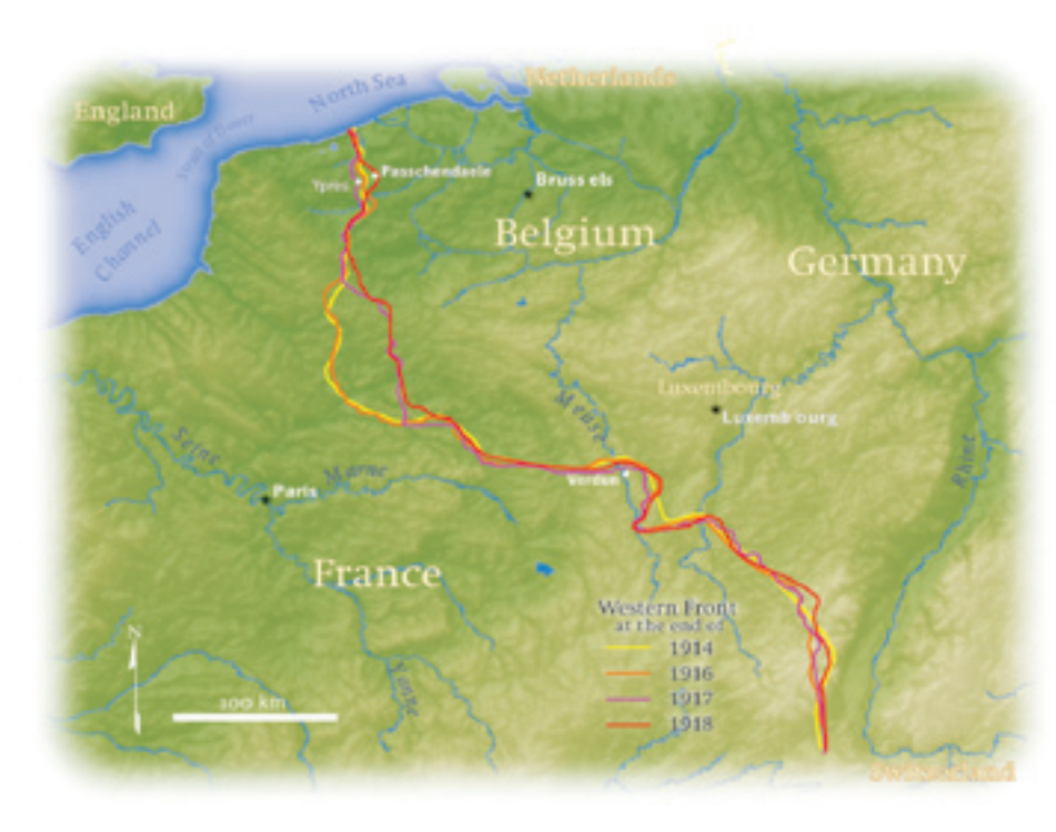
By September 1914, the Germans had pushed through Belgium and northern France to within 50 kilometres of Paris. The Western Front would not move more than 40 kilometres until the end of the war.