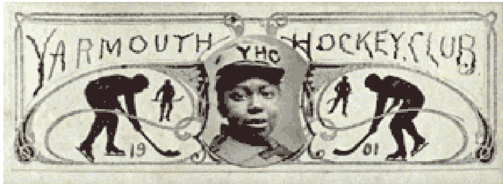
AFRICVILLE SEA-SIDES Colored hockey team of the Maritimes 1895-1925