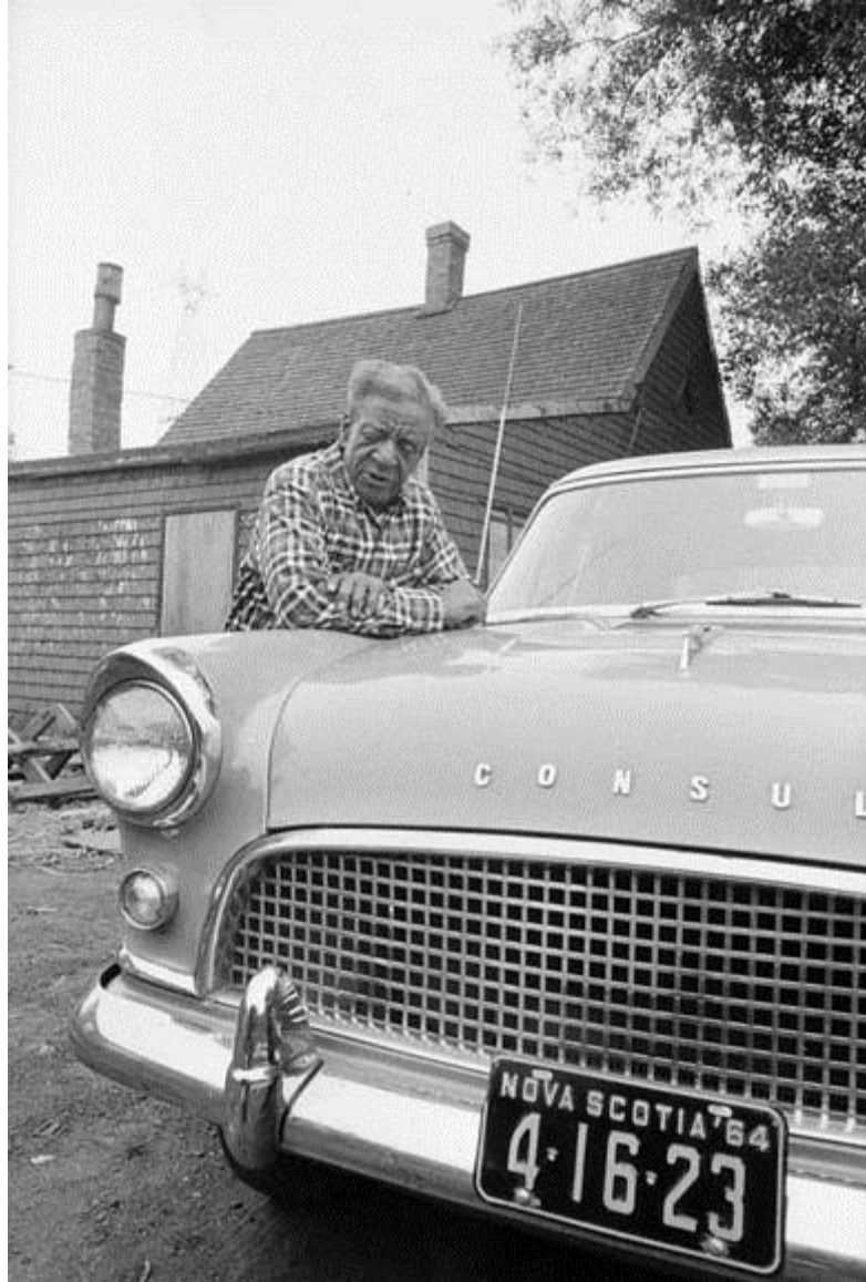
Man from Africville, Nova Scotia, 1965