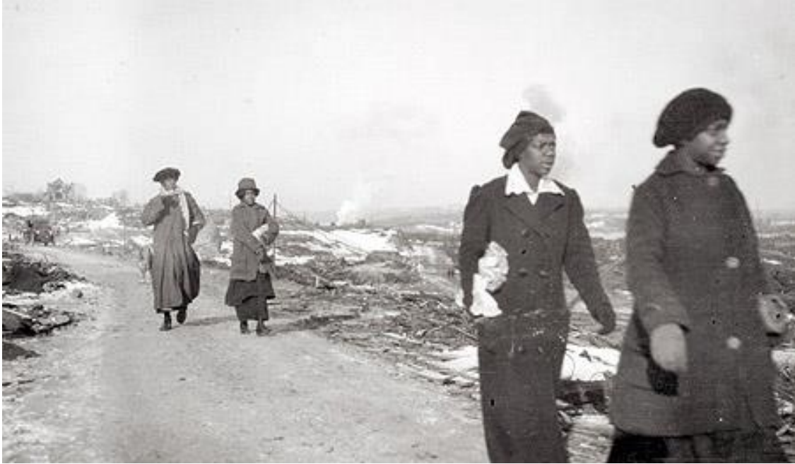
Women walking from Africville towards Halifax, on Campbell Road near Hanover Street, 1917 or 1918