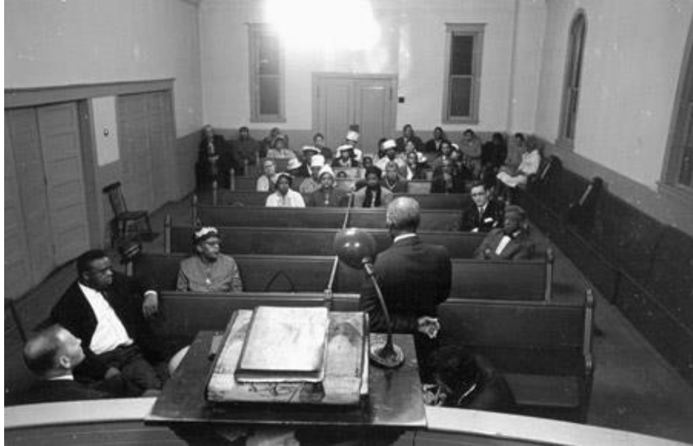
Africville Relocation Meeting, Seaview Baptist Church, Halifax, ca. 1962