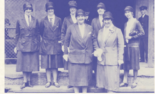
Women's Bureau officers at Québec, 1928 (courtesy Library and Archives Canada/Edwards/C.G. Motion Picture Bureau/C-045113).