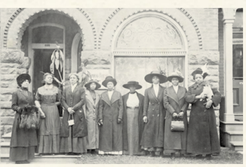
Group of Black women in front of a Y.W.C.A. boarding house, Toronto, Ontario, 1917.

If possible, include a primary source for extra interest. This might be a photograph, a painting, a poem, a letter, or a newspaper story about the topic.