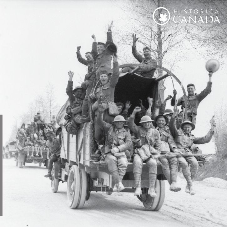
Canadian Byng Boys returning after beating the Germans at Vimy Ridge (courtesy Library and Archives Canada/PA-001451).

CORROBORATION: Evidence that confirms a conclusion.