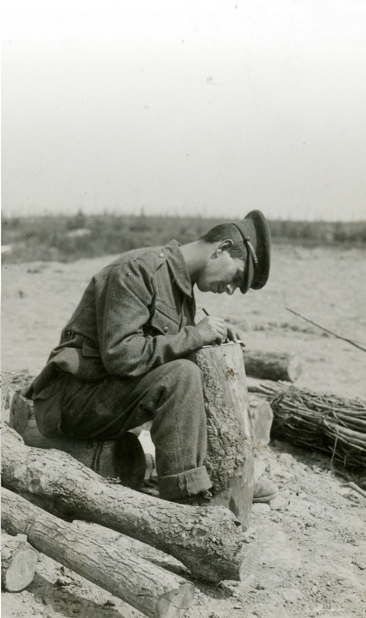
An improvised desk.