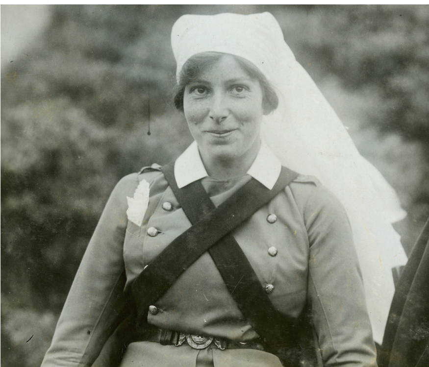
A Canadian nurse.