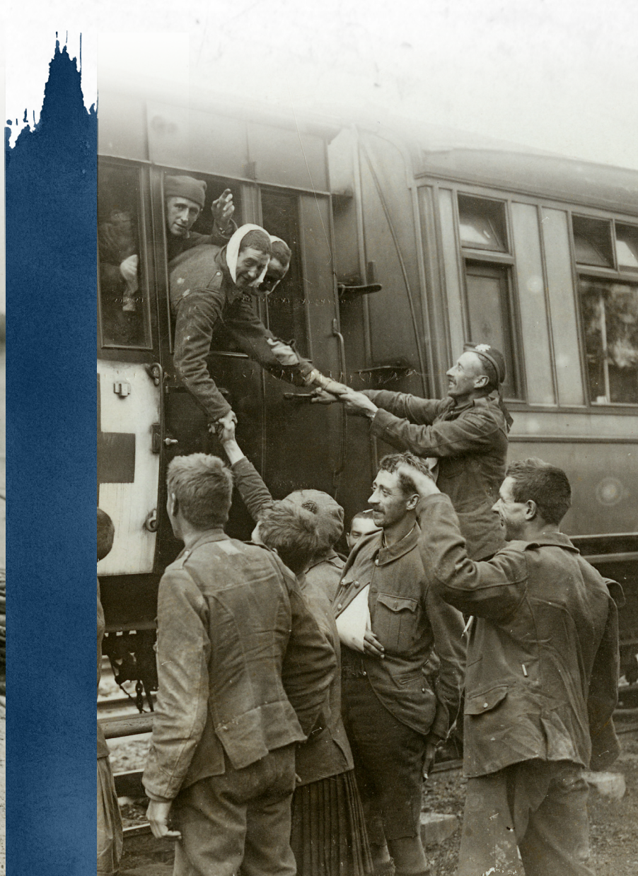
On the way to Blighty. Soldiers say goodbye to wounded comrades leaving a casualty clearing station.