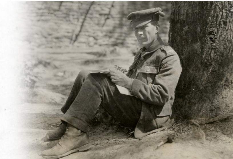
A private moment.