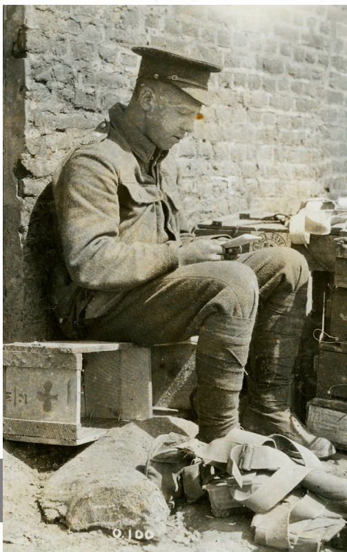
A letter from home.

TEACHER TIP: To complete these worksheets, students may want to watch the videos more than once. Turning on the subtitles can help second language learners understand the video. Watch the video as a class at least twice before beginning the worksheets. Work through the steps above, starting and stopping the video as needed.