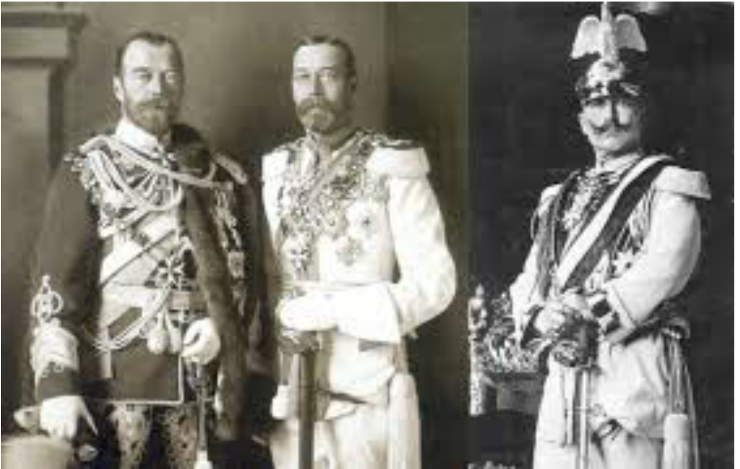
Tsar Nicholas II Russia