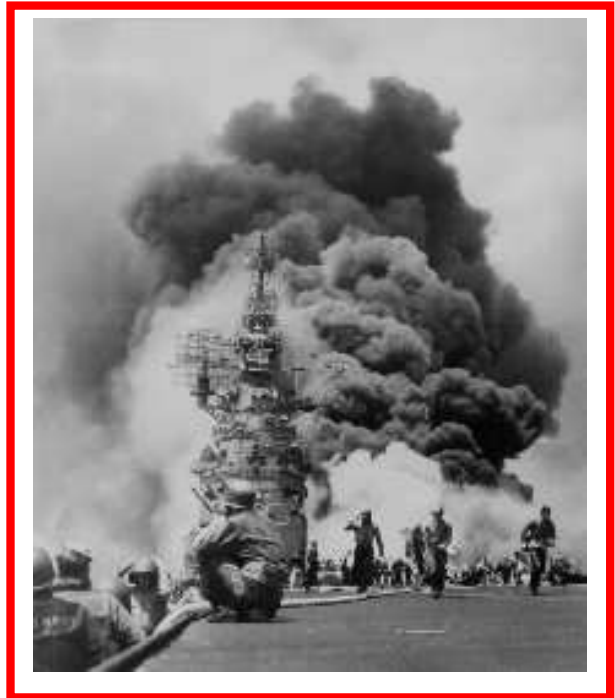
Kamikaze attack on US Carrier

Samurai spirit rose to project Nihon. A Divine Wind to protect, was called. To sink US Navy ships, the Kamikaze, too late, defeat could not be stalled.