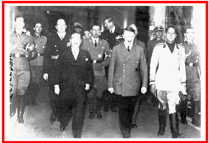
Meeting of Axis Powers

An obstacle to this plan was the United States navy, so negotiate, gather intelligence, then strike a fatal blow and defeat.