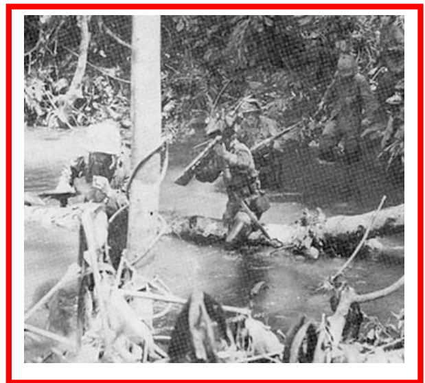
Marines on Patrol on Guadalcanal

After Guadalcanal, the tide turned. American power, aroused from its rest. In the Islands of the Pacific Ocean, the US Marines met the test.