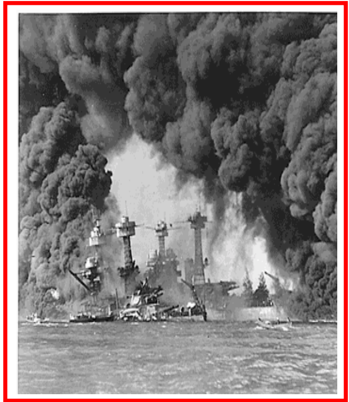
Pearl Harbor, December 7 th , 1941

The blow roused American fury after that Infamous 7 th day, and revenge would soon follow at the Battle of Midway.